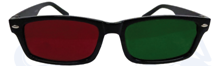
Plastic, 1 pair, adult size Red lens on right side - green lens on left