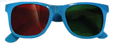
Plastic, 1 pair, pediatric size Frame color may vary

Worthmore® II Four Dot Test with a pair of red-green glasses (#9397). Lightweight, palm-sized.