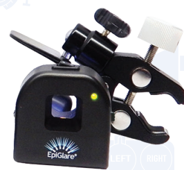
98870 Single Phoropter Kit