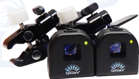
98871 Binocular Phoropter Kit