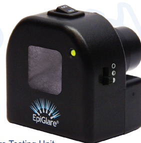
EpiGlare Testing Unit

The EpiGlare eye piece can be removed from the handheld desk kit and placed in the phoropter: no additional attachment is necessary.