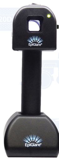
98872 Handheld Desk Kit